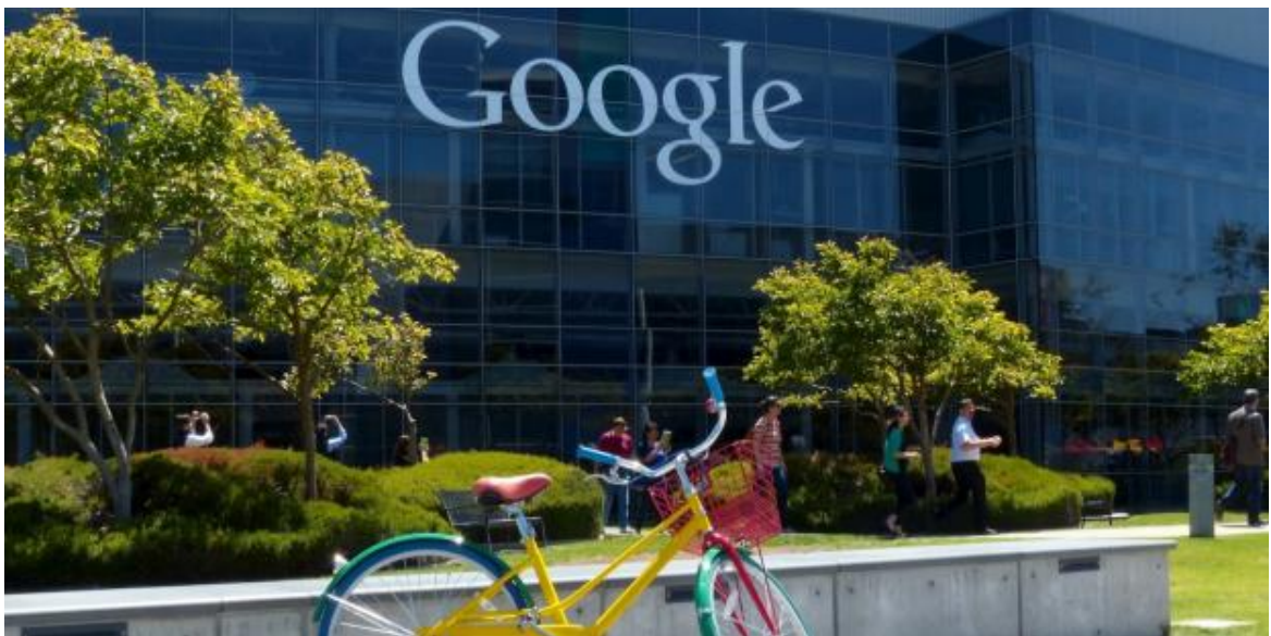
Google Roman Boed/Flickr