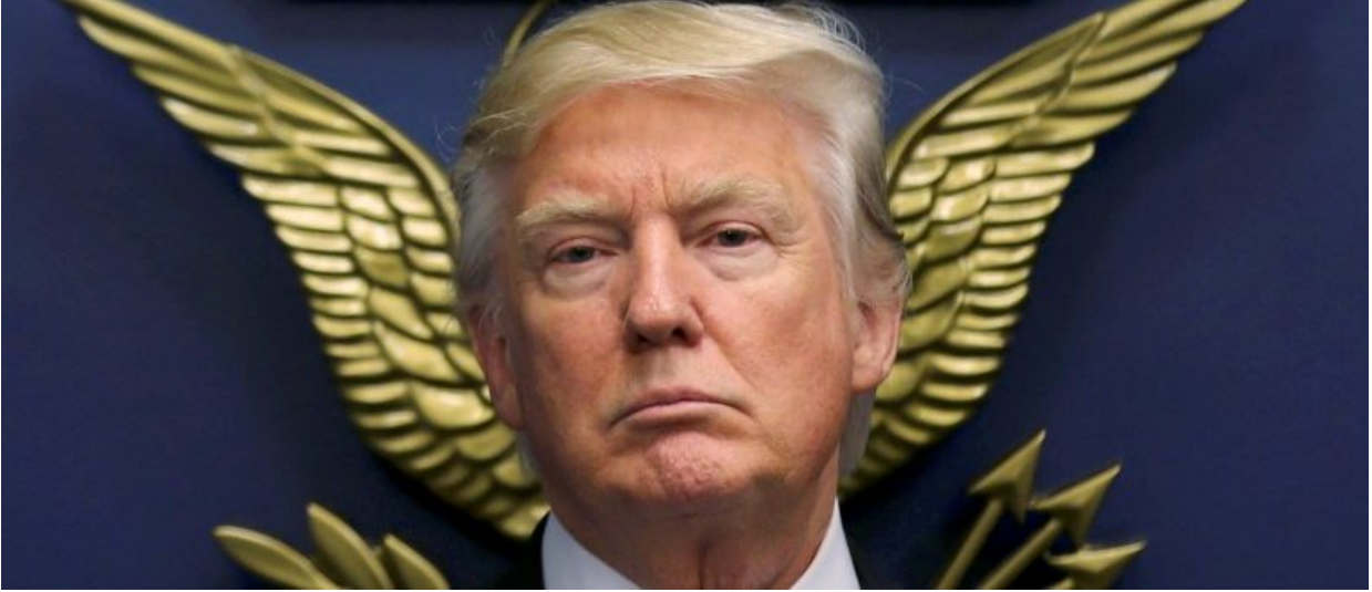
President Donald Trump looks on following a swearing-in ceremony for Defense Secretary James Mattis at the Pentagon in Washington, January 27, 2017.