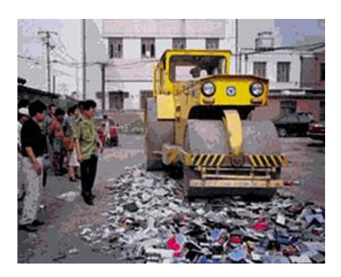
Falun Gong books symbolically destroyed by Chinese government

The application of the labels "cult" or "sect" to religious movements in government documents signifies the popular and negative use of the term "cult" in English and a functionally similar use of words translated as "sect" in several European languages. [134] Sociologists critical to this negative politicized use of the word "cult" argue that it may adversely impact the religious freedoms of group members. [135] At the height of the countercult movement and ritual abuse scare of the 1990s, some governments published lists of cults.[136] While these documents utilize similar terminology they do not necessarily include the same groups nor is their assessment of these groups based on agreed criteria. [134] Other governments and world bodies also report on new religious movements but do not use these terms to describe the groups. [134] Since the 2000s, some governments have again distanced themselves from such classifications of religious movements.[137] While the official response to new religious groups has been mixed across the globe, some governments aligned more with the critics of these groups to the extent of distinguishing between "legitimate" religion and "dangerous", "unwanted" cults in <u>public policy</u>. [<u>53</u>][<u>138</u>]