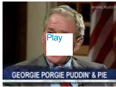
Former President Bush Defends GM and Chrysler Bailout